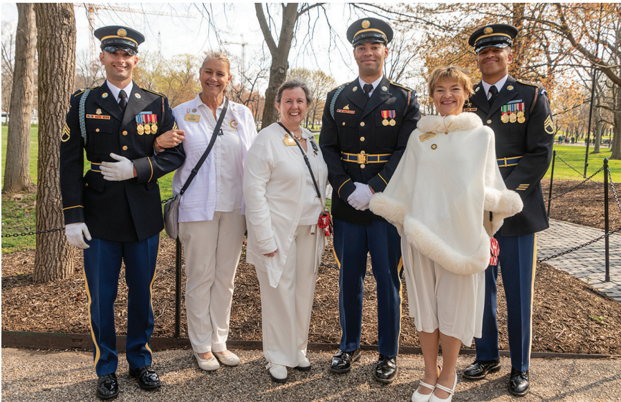
Our escorts to lay flowers at The Wall