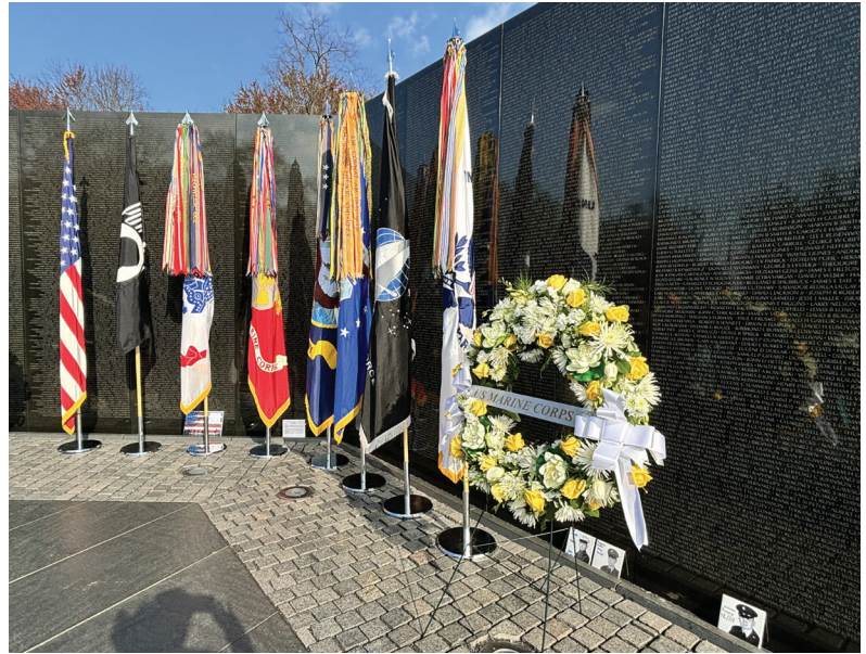
The Vietnam Veterans Memorial 29 March 2024