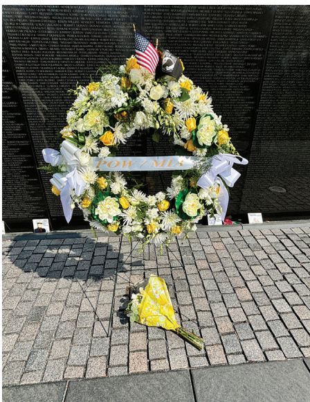
POW / MIA Wreath