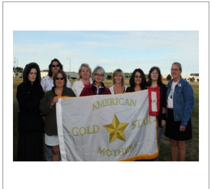
Gold Star Families Volunteer at McClung Run

Gold Star License Plates Members of the WSGSM chapter worked with the 2008 Legislators to pass a bill authorizing a specialty license plate for Washington State Gold Star Mothers and Fathers. All Gold Star