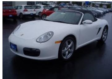
1st Prize: A porsche to drive for the weekend