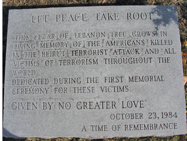
Beirut Barracks Memorial, Arlington National Cemetery, Section 59

"That Marine and all those others like him, living and dead, have been faithful to their ideals. They've given willingly of themselves so that a nearly defenseless people in a region of great strategic importance to the free world will have a chance someday to live